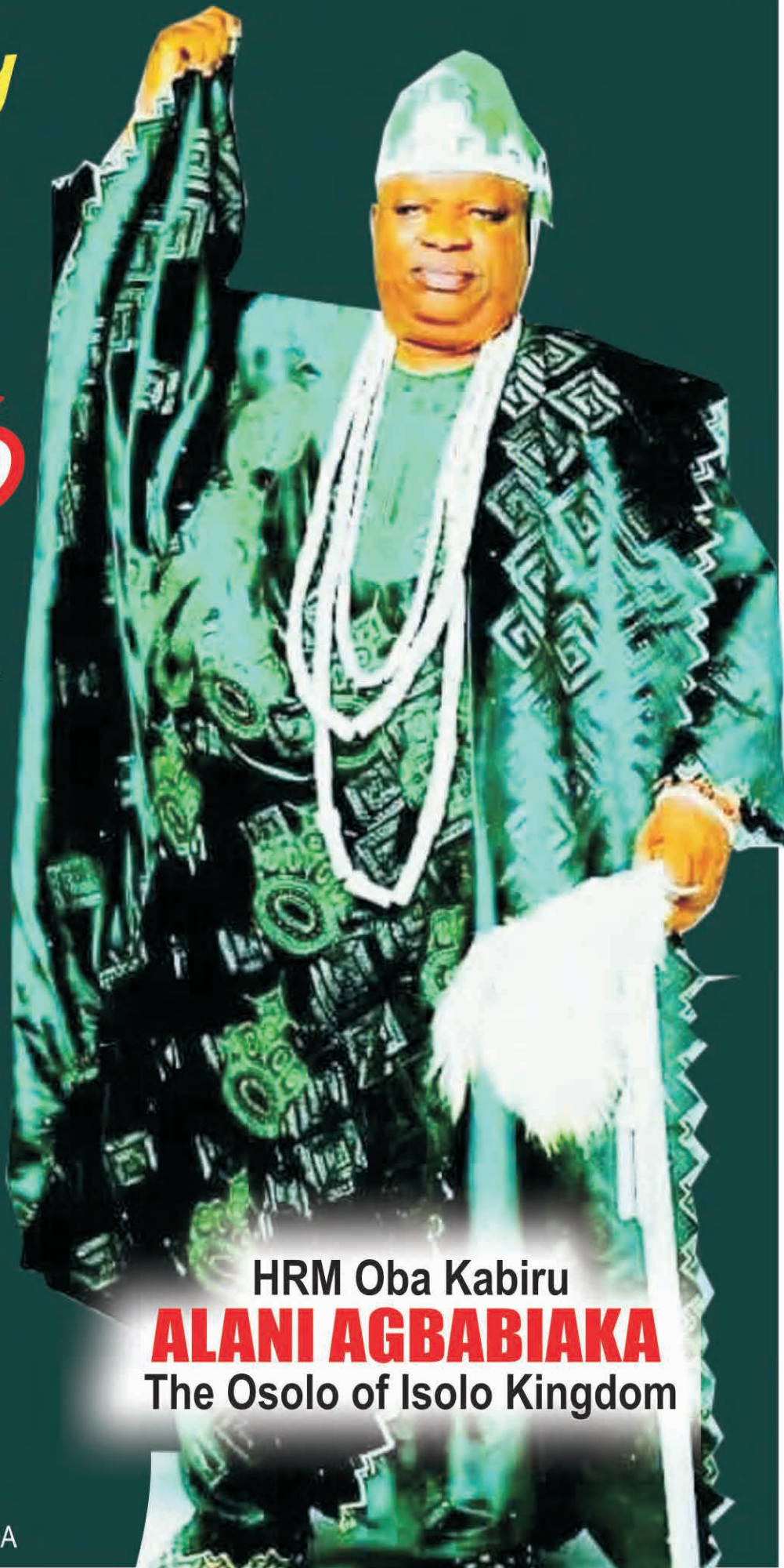
HRM Oba Kabiru ALANI AGBABIKA The Osolo of Isolo Kingdom