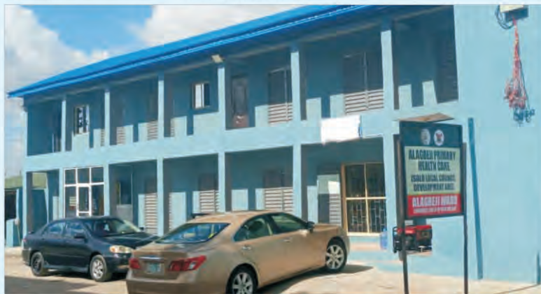
The shopping complex

It remains to be seen if the lawsuit will be dropped to allow the conversion to take effect even as public notice has been made on the building to warn business owners currently occupying the premises to desist from the act, stressing that the edifice "was not constructed as an offer to buy or sell or to participate in any trading activity."