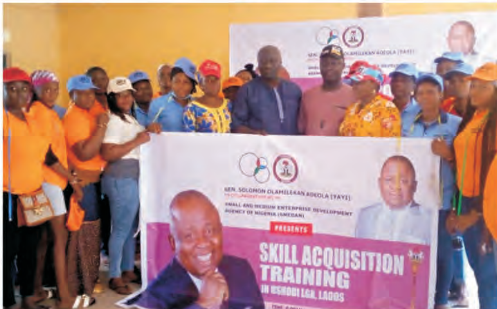
Tailoring beneficiaries in photograph with the coordinators